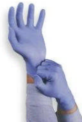
RSI-7500PF (S-XL) 4-Mil Blue Powder-Free Nitrile RSI-8500PF (S-XL) 8-Mil Blue Powder-Free Nitrile 100 per Box 10 Boxes per Case