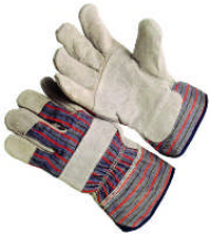
RSI-2400-L Economy Leather Patch Palm 10 Dozen per Case