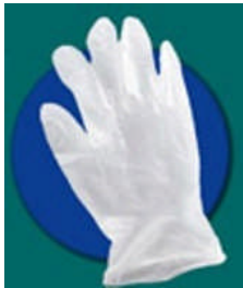
RSI-PFVD (S-XL) Powder-Free Vinyl Disposable Gloves 100 per Box 10 Boxes per Case