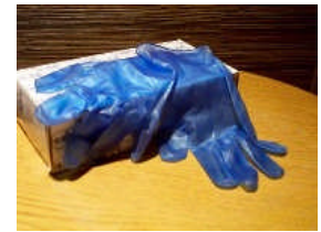
RSI-BVDG (S-XL) Blue Vinyl Disposable Gloves 100 per Box 10 Boxes per Case