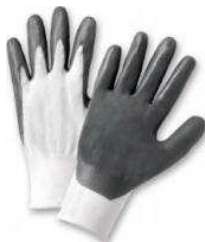
RSI-225 (S-XL) White Nylon Liner w/Gray Nitrile Palm 12 Dozen per Case **Comparable to PIP-C225**