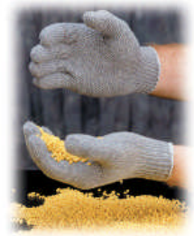
RSI-4GSK (S&L) Basic Gray String Knit Glove 25 Dozen per Case