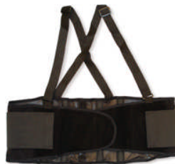
RSI-BS10 Black Economy Back Support w/SS Sizes: Regular, Jumbo & Grande