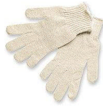
RSI-2BSK-(S&L) Basic String Knit Glove 30 Dozen per Case **Comparable to MEM-9636**