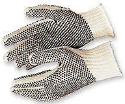
RSI-2SDB (S&L) Basic String Knit Glove with PVC Dots on Both Sides 20 Dozen per Case **Comparable to MEM-9660**