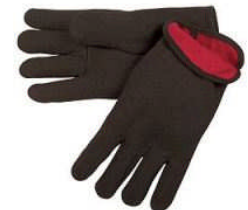
RSI-RLBJ Men's Red-Fleece Lined Brown Jersey Glove 25 Dozen per Case **Comparable to MEM-7900**