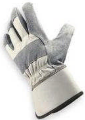
RSI-6191 (M-XL) Single Leather Palm Glove Sewn with Kevlar 6 Dozen per Case **Comparable to MEM-1700**