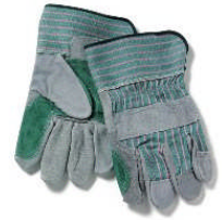
RSI-23DP Double Leather Palm Glove with Green Back Safety Cuff 6 Dozen per Case