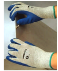
RSI-1300 (S-XL) “Premium” Grey Knit Liner with Blue Rubber Palm 6 Dozen per Case **Comparable to MEM-9680, PFG-300 & ANE-80-100**