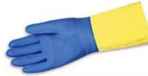
RSI-244 (S-XL) 28-Mil Neoprene over Latex Glove 10 Dozen per Case **Comparable to ANE-224**