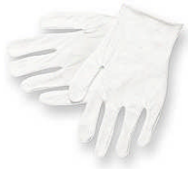
RSI-INSP 100% Cotton Lisle Inspectors Glove 100 Dozen per Case **Comparable to MEM-8600**