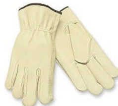
RSI-34PK (S-XL) Grain Leather Pigskin Drivers Glove with Keystone Thumb 12 Dozen per Case **Comparable to MEM-3400, 3401 & 3411**