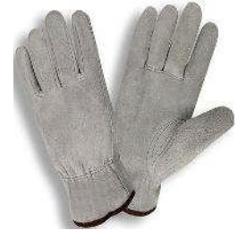
RSI-31SL (S-XL) Gray Split Leather Drivers Glove 12 Dozen per Case **Comparable to MEM-3100, MEM-3101 & WES-980**