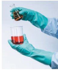
RSI-515F (S-XL) 15-Mil 13" Nitrile Flock-lined 12 Dozen per Case **Comparable to MAR-G25G, BES-730 & ANF-37-175**