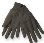
RSI-1BBJ Men's 100% Cotton Brown Jersey Glove 25 Dozen per Case **Comparable to MEM-7100**