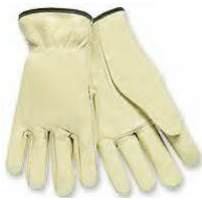
RSI-32CK (S-2XL) Grain Leather Drivers Glove with Keystone Thumb 12 Dozen per Case **Comparable to MEM-3201, 3211**