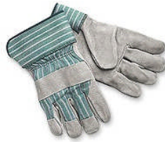
RSI-2322 Leather Palm Glove with Green Back Safety Cuff 10 Dozen per Case