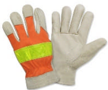
RSI-HV34 (M-XL) Hi-Viz Orange Pigskin Drivers 12 Dozen per Case