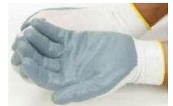
RSI-800 (S-XL) White Nylon Liner w/ Gray Foam Nitrile Palm 12 Dozen per Case **Comparable ANE-80-100**