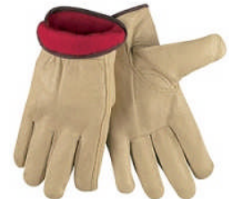
RSI-RL34 (S-XL) Grain Leather Pigskin Drivers Glove with Red-Fleece Lining 12 Dozen per Case **Comparable to MEM-3450**