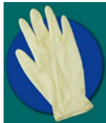
RSI-INDPS 5-Mil Powdered Latex RSI-INDPFT 5-Mil Powder-Free Latex 100 per Box 10 Boxes per Case