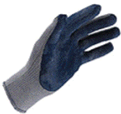
RSI-300 (S-XL) “Value” Grey Knit Liner w/Blue Rubber Palm 12 Dozen per Case **Comparable to PFG-300 & MEM-9680**