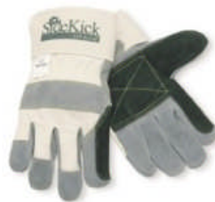
RSI-6192 (M-XL) Double Leather Palm Glove Sewn with Kevlar 6 Dozen per Case **Comparable to MEM-1711**