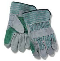
RSI-23DP (S-XL) Double Leather Palm Glove with Green Back Safety Cuff 6 Dozen per Case