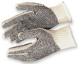
RSI-2SDB (S&L) Basic String Knit Glove with PVC Dots on Both Sides 20 Dozen per Case **Comparable to MEM-9660**