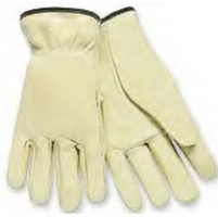
RSI-32CK (S-2XL) Grain Leather Drivers Glove with Keystone Thumb 10 Dozen per Case **Comparable to MEM-3201, 3211**