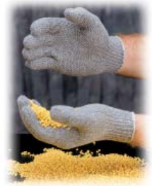
RSI-4GSK (S&L) Basic Gray String Knit Glove 25 Dozen per Case