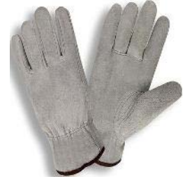
RSI-31SL (S-XL) Gray Split Leather Drivers Glove 10 Dozen per Case **Comparable to MEM-3100, MEM-3101 & WES-980**