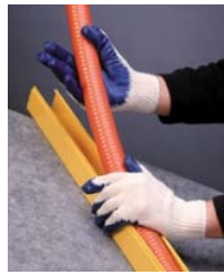
RSI-BPCS (S&L) Basic String w/Blue Coated Palm 20 Dozen per Case **Comparable to PIP-C122 & MEM-9681**