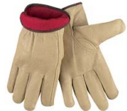
RSI-RL34 (S-XL) Grain Leather Pigskin Drivers Glove with Red-Fleece Lining 6 Dozen per Case **Comparable to MEM-3450**