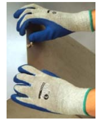
RSI-1300 (S-XL) "Premium" Grey Knit Liner with Blue Rubber Palm 6 Dozen per Case **Comparable to MEM-9680, PFG-300 & ANE-80-100**