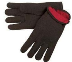
RSI-RLBJ Men's Red-Fleece Lined Brown Jersey Glove 12 Dozen per Case **Comparable to MEM-7900**