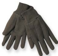
RSI-1BBJ Brown Jersey Glove 25 Dozen per Case **Comparable to MEM-7100**