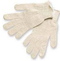
RSI-2BSK-(S&L) Basic String Knit Glove 40 Dozen per Case **Comparable to MEM-9636**