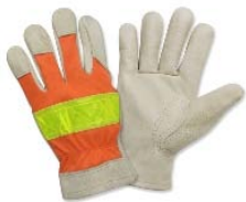
RSI-HV34 (M-XL) Hi-Viz Orange Pigskin Drivers 6 Dozen per Case