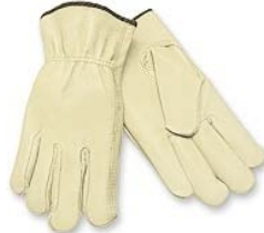
RSI-34PK (S-XL) Grain Leather Pigskin Drivers Glove with Keystone Thumb 10 Dozen per Case **Comparable to MEM-3400, 3401 & 3411**