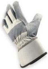
RSI-6191 (M-XL) Single Leather Palm Glove Sewn with Kevlar 6 Dozen per Case **Comparable to MEM-1700**