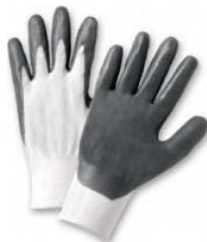
RSI-225 (S-XL) White Nylon Liner w/Gray Nitrile Palm 12 Dozen per Case **Comparable to PIP-C225**