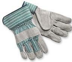
RSI-2322 (S-XL) Leather Palm Glove with Green Back Safety Cuff 10 Dozen per Case