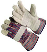
RSI-2400-L Economy Leather Patch Palm 10 Dozen per Case