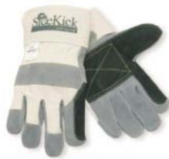
RSI-6192 (M-XL) Double Leather Palm Glove Sewn with Kevlar 6 Dozen per Case **Comparable to MEM-1711**