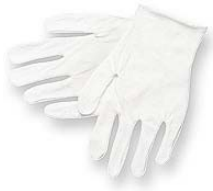
RSI-INSP 100% Cotton Lisle Inspectors Glove 100 Dozen per Case **Comparable to MEM-8600**